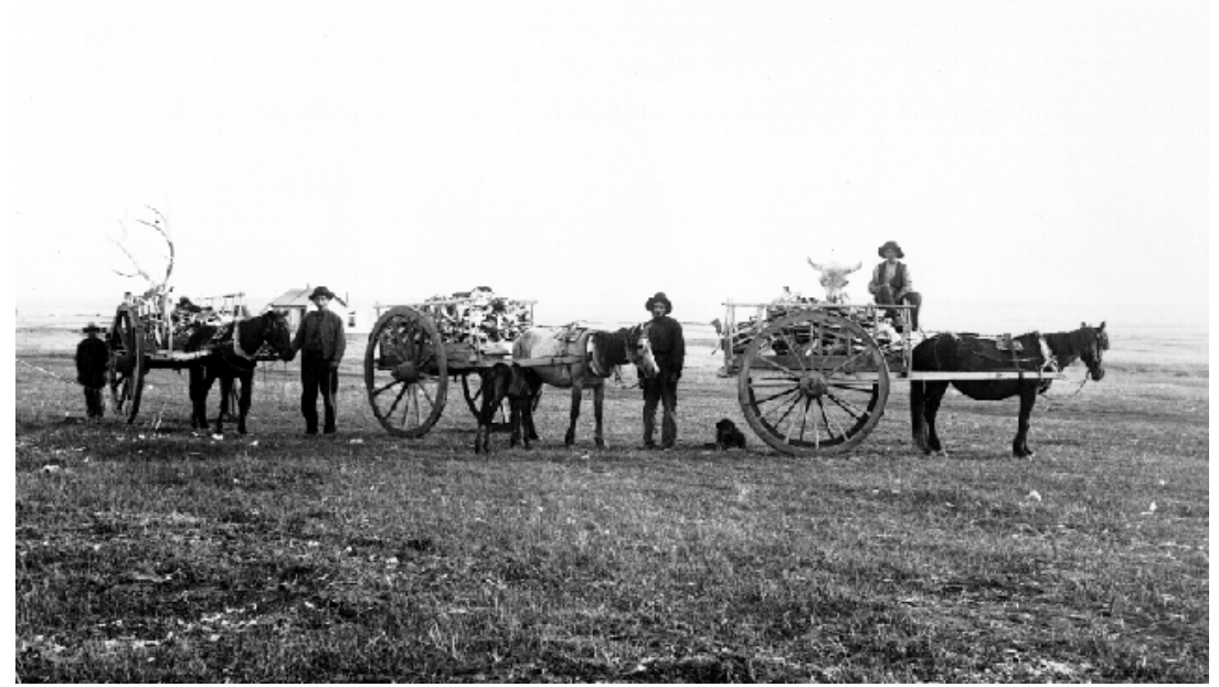
Metis buffalo bone pickers at Minnewaukan, Dakota Territory, May 24, 1886

With the demise of the great buffalo herds and the arrival of the railway, the Metis were reduced to using their carts to pick buffalo bones. These were sold for processing sugar and making fertilizer and buttons.