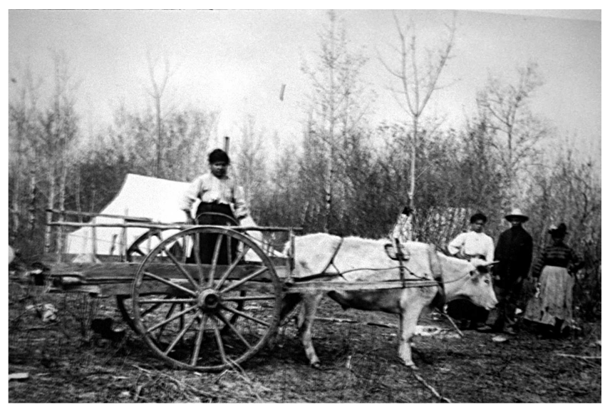
Metis family with cart at Turtle Mountain, North Dakota.

embroidered leather coats, moccasins, saddles, &c. these they sell or exchange in St. Paul and return again to their secluded home...<sup>2</sup>