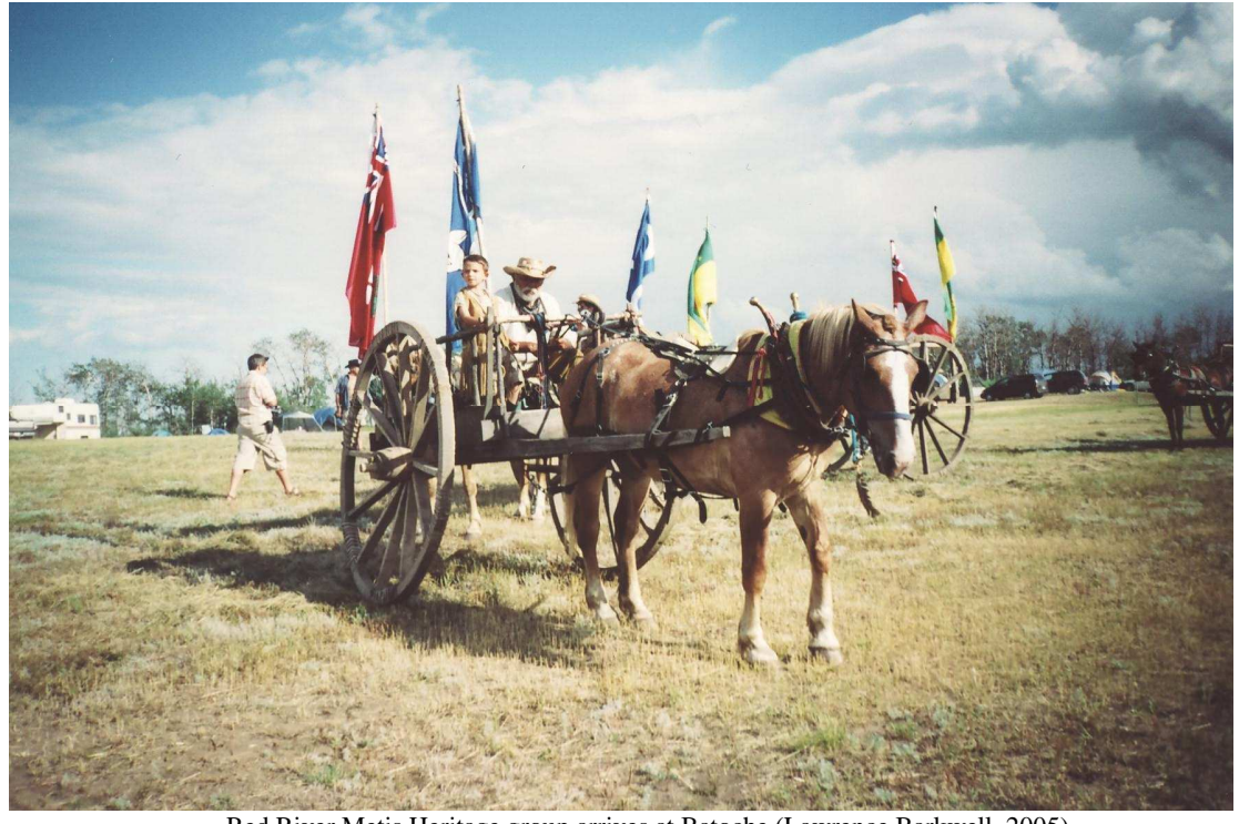
Red River Metis Heritage group arrives at Batoche (Lawrence Barkwell, 2005)